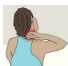
Shoulder and neck pain

Develop over a period of weeks, months, or years